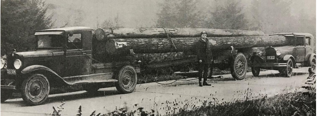
In the years after WWI, Washingtonians were on the move. More motorcycles, cars, and trucks meant the need for more paved roads and more concern for safety. Even though top speeds of the day were a fraction of current capacities, a lack of industry safety standards, inconsistent regulations, and lax enforcement attention often led to deadly consequences. In this undated WSP photo, a logging truck with no taillights led to tragedy on a foggy roadway.

These officers went on sometimes-solo assignments across the state equipped with only a badge, a side arm, a Highway Patrol armband and a WWI surplus Indian motorcycle. (Uniforms were not issued until 1924.) Enforcing fledgling traffic laws in a time when there were far more horses than cars and less than a thousand miles of paved road statewide sometimes meant dealing with real antipathy toward the very idea of a “speed limit.” They often carried camping gear in their sidecars along with emergency equipment to fight forest fires during what could be months-long deployments. It would be almost two decades before WSP began using cars as its main vehicle choice but the mission of keeping the public safe through traffic law enforcement proudly continues with the modern Washington State Patrol.