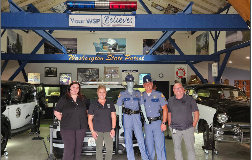
PUYALLUP, Wash. – The Washington State Fair is in full swing! If you are working any of the shifts, be sure to send in photos to share in a future edition of The Milepost.