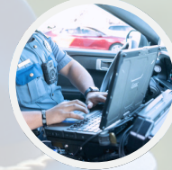
Records Management System Replacement